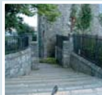
St Audoen's Park