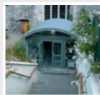
St Audoen's Interpretative Centre