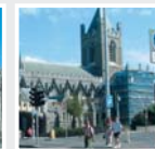
Christ Church Cathedral