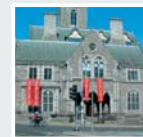
Dublinia (former Synod Hall)