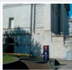
City Hall Interpretative Centre