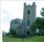
St Audoen's Church