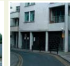
Site of Isolde's Tower