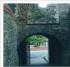
St Audoen's Arch