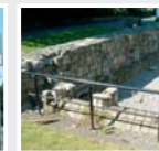
Chapter-house in ruins