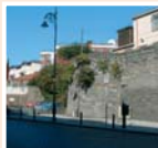
City wall, Ship Street Little