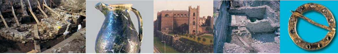
L-r: Isolde's Tower, which can be seen on Lr Exchange St; Dublin wine jug dating to the 13th century; St Audoen's Church, High St (12th century); Genevel's Tower, now underground at Ross Rd; bronze ring brooch dating to the 13th century.