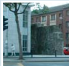
City wall, Lamb Alley