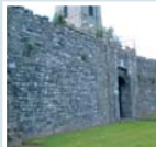
City wall, Cook St